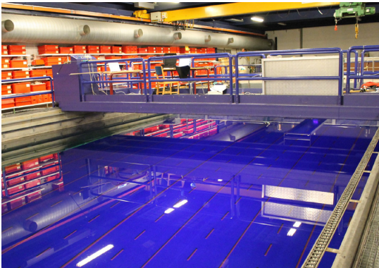
Arqus A9UW or A12UW can be used for large volume marine measurements, such as large Ocean basins and towing tanks.

Another example is studying the kinematics of swimmers, where researchers and coaches use data collected by the underwater motion capture system to analyze the athlete's dive and stroke. It is also possible to combine Qualisys underwater cameras with the skeleton solver functionality in QTM to capture underwater motions performed by actors in games and films.