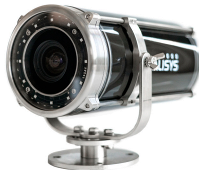
Miquis Underwater cameras are ideal to use in small to medium sized volumes, up to 15m (50ft) range.