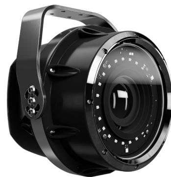
Arqus Underwater is a robust, high resolution camera primarily suited for medium to long-range measurements, from 7-30m (25 - 100ft).

By combining Qualisys groundbreaking underwater cameras with an above water camera system, in what is known as a 'Twin system' setup, above- and underwater movement can be merged together into a single capture.